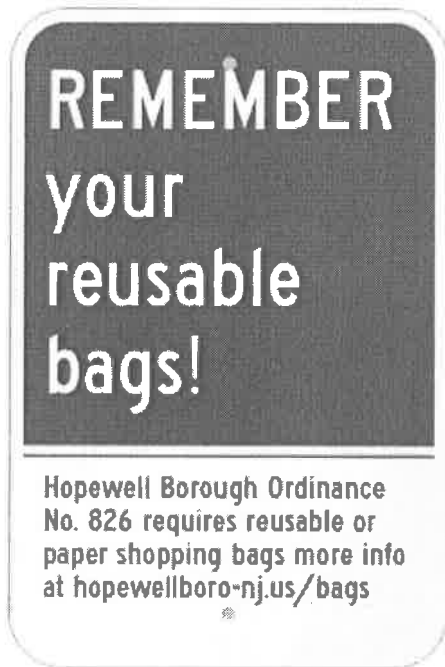
Mock up of potential parking lot sign at https://www.myparkingsign.com/ (left)