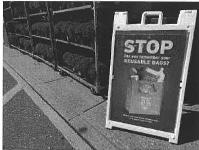
Possible A-Frame signs to double as bag distribution points with the addition of a hook to hold bags.